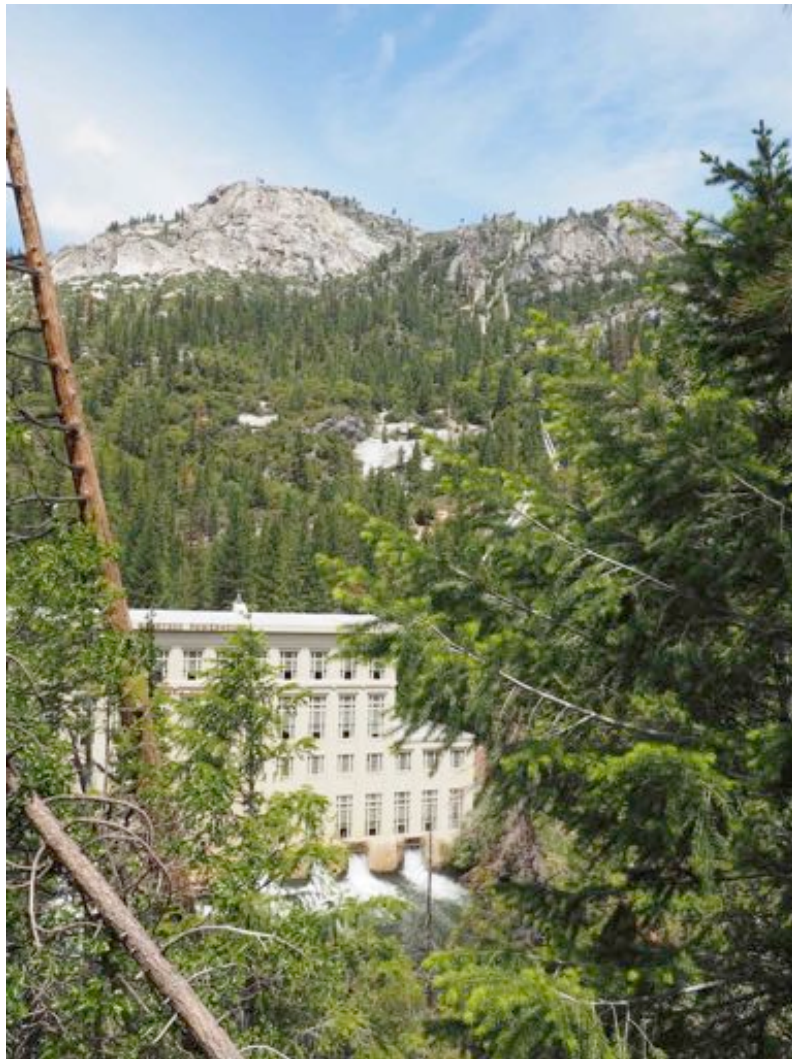
Figure 1. Big Creek Power House No. 1, which went into operation in 1913. The penstocks—high-pressure pipes carrying water from upstream reservoirs—can be seen on the mountainside above and just to the right of the power house.

sources, it is still capable of generating more than 1,000 megawatts—about the capacity of one of the reactors at Diablo Canyon, California’s only remaining nuclear power plant. 4 In the hope of capturing the interaction of birds and infrastructure on camera, I am following as closely as possible the high-tension transmission lines that connect Big Creek to a substation near Pasadena. There Big Creek’s power—supplemented by electricity generated at other facilities—is reduced to a lower voltage by transformers, directed into numerous smaller distribution lines, and delivered to consumers throughout the Los Angeles area.