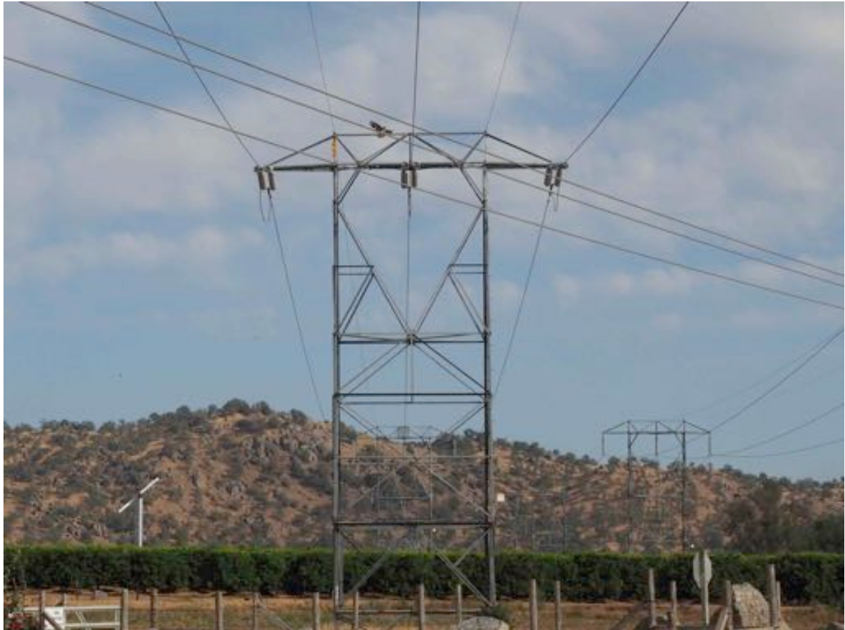
Figure 3. A red-tailed hawk landing on one of the Big Creek transmission towers near Sanger, California.

The red-tail flies off the tower after only a few minutes, but a pair of crows are soon squabbling in his or her place. The tower on which they are perched supports one of two parallel lines from Big Creek to the Eagle Rock substation near Pasadena. Each line consists of three wires, each of which carries alternating current at 220,000 volts and 60 cycles per second. (For reasons that exceed my grasp of electromagnetism, circuits composed of three wires are apparently better than two for electric power distribution.) 38 As I have learned from the Huntington Library's collection of Southern California Edison photographs and other sources, the pans and spikes that are visible on the towers have been in use since the 1910s or 1920s to minimize the impact of birds on electric power transmission. They are what one might call bioinsulators: devices and practices meant to isolate the system from its living environment. Such forms of insulation are essential to the existence of autonomous organisms;