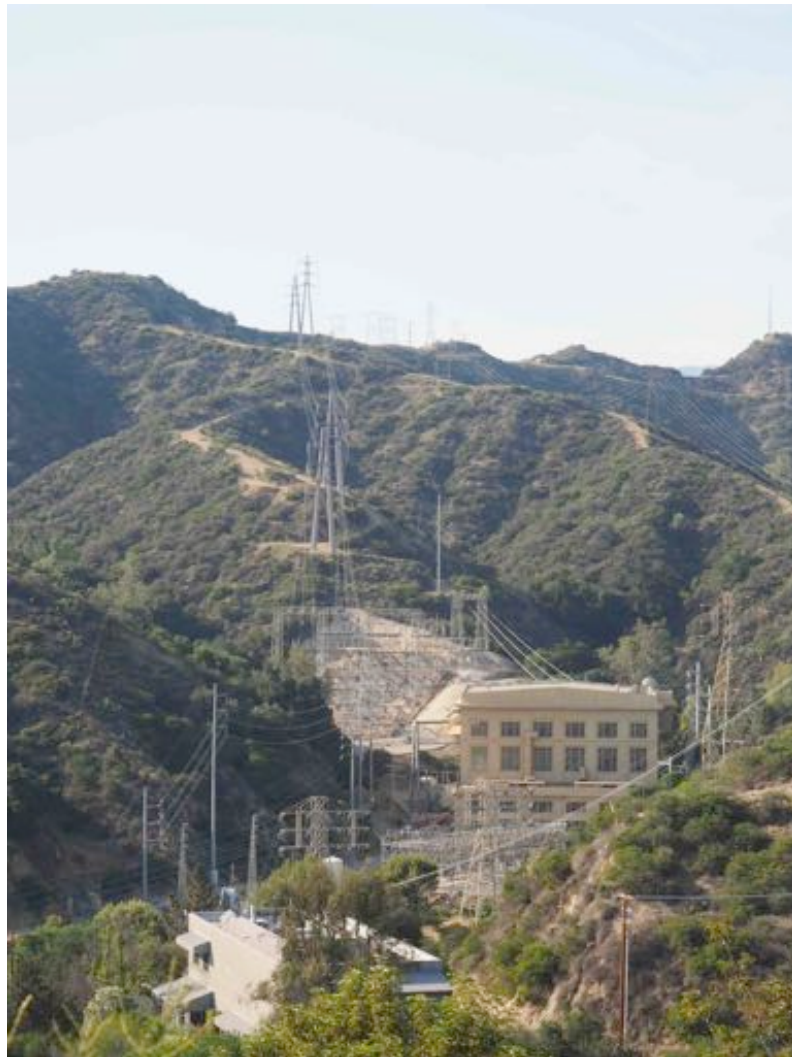
Figure 6. Eagle Rock Substation near Pasadena, California. The transmission lines from Big Creek are in the background running up the hill; lower-voltage distribution lines heading toward Los Angeles can just be seen at the lower left-hand corner of the image.

demand, and it did so not merely through redundancy but also through automation, which allowed the system to rapidly shift load between different parts of the grid and adapt to interruptions. This automation was partly electrical and partly social; it depended as much on the training and vigilance of operators as it did on the configuration of lines, relays, and switches. Interconnection also brought new risks; as the widespread blackout in eastern North America in 2003 showed, the more complex and interdependent the power system becomes, the less predictable the behavior of the system as a whole can be. 61 Nonetheless, despite such eruptions of unexpected agency, the overall impact of interconnection was to bolster stability.